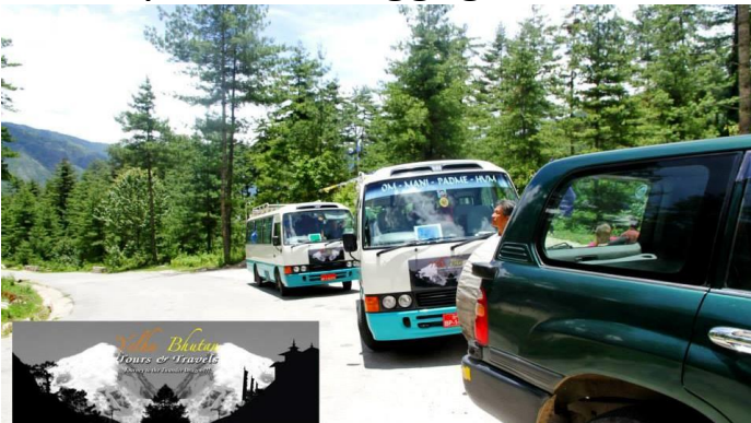
18-21 Seat 3-4 Cylinder Bus