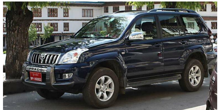
Upgrade SUV for 1-2 Pax