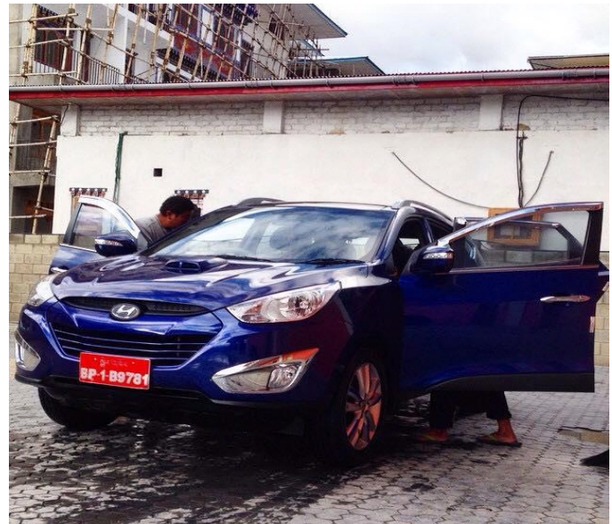
Hyundai Tucson SUV 1-2 Pax

Mobile: 00975-17609635, Telephone:00975-2326050 E-mail: yelhabhutan@gmail.com / info@bhutanonlinevisa.com | website: www.bhutanonlinevisa.com