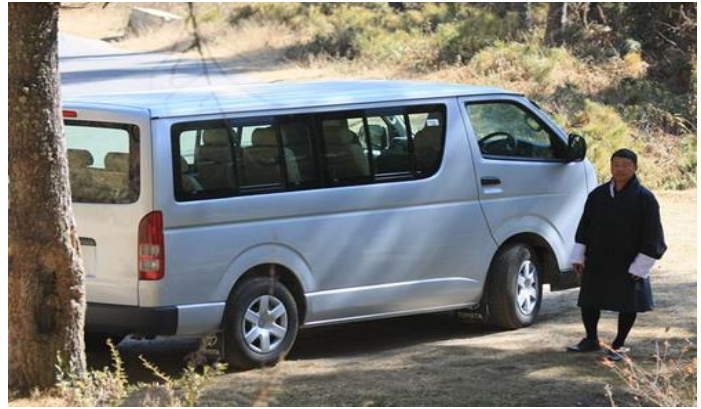
3-8 Pax Toyota Hi Ace Bus