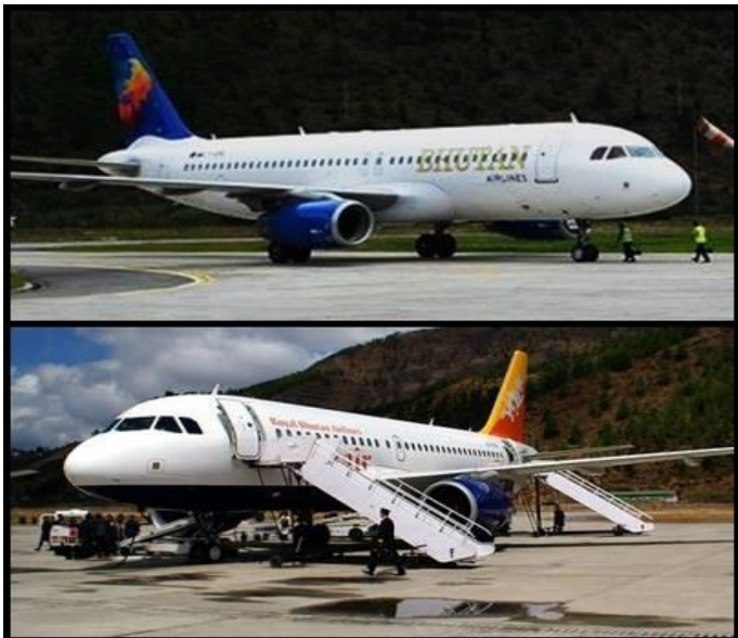
Druk Air / Bhutan Airlines