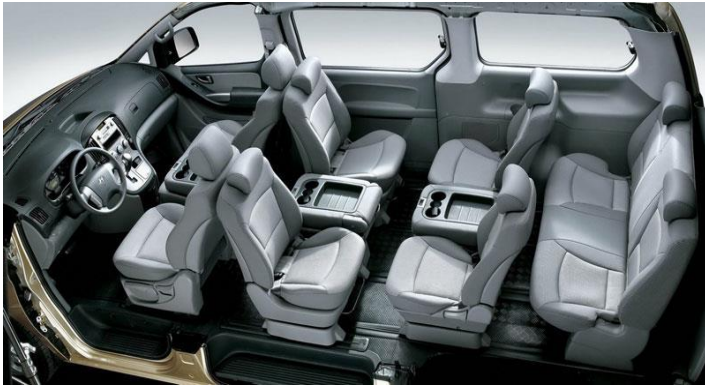
3-6 Pax / Toyota H1 Bus

DORJI GYELTSHEN BUILDING, Building No. 31B, Flat No. 201 OPP. DPNB, NORZIN LAM, THIMPHU: BHUTAN -