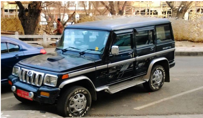
Independent Luggage Vans GIT